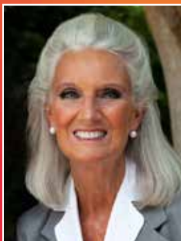
ANNE GRAHAM LOTZ